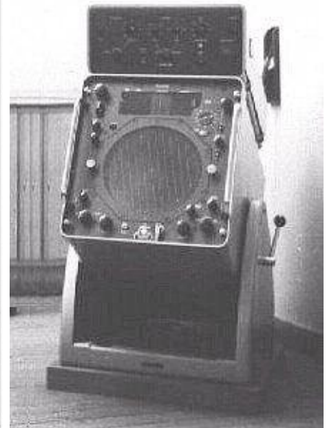
Marconi Hermes Radar